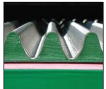
PYRAMID PLUS (PMD+ ™ )